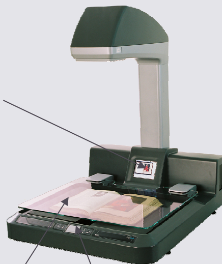
Touchpad + function keys

DIMENSIONS in mm 810 (W) x 990 (D) x 1100 (H) in inches 32 (W) x 40 (D) x 44 (H)