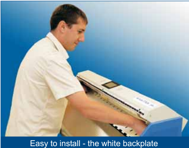
Easy to install - the white backplate

Effective and cost-efficient scanning of transparent documents