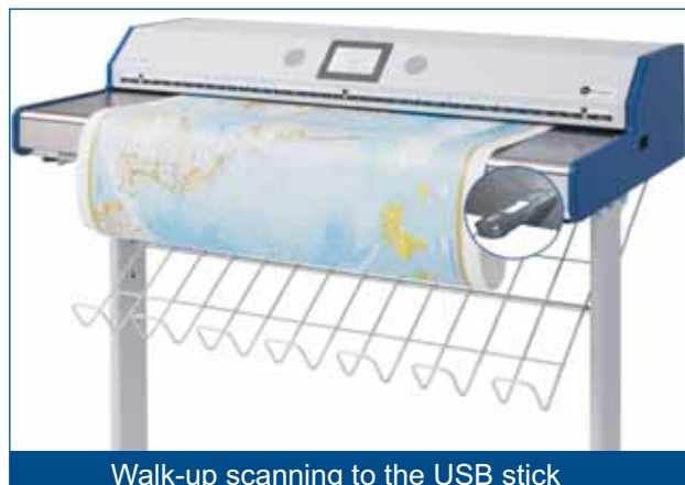
Walk-up scanning to the USB stick

The cutting edge camera technology, consisting of a dust-protected, hermetically sealed camera box holding CCD systems using a patented stitching procedure, delivers an optical resolution of 1200 x 600 dpi.