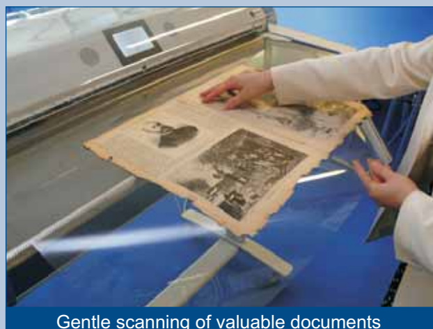
Gentle scanning of valuable documents

Automatic document size recognition allows operators to pass sensitive documents through the middle of the scan area, protecting documents from any damage.