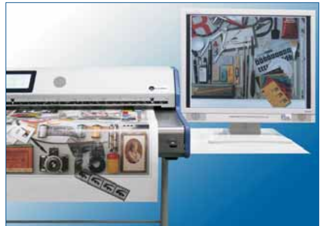
High resolution scan results of detailed documents